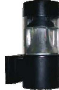
LT15 Internal Cone Reflector