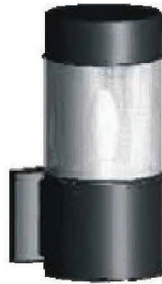
LT14 Internal Glass Refractor