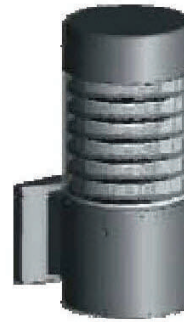
LT16 Internal Louver