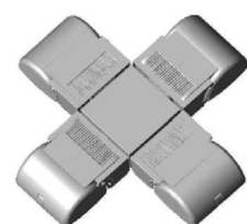
Quad Arm Cover QADCV4