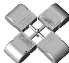
Quad Arm Bracket QADBK4