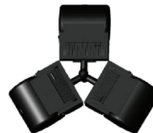
Triple Arm Bracket QADBK3