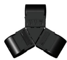
Triple Arm Cover QADCV3